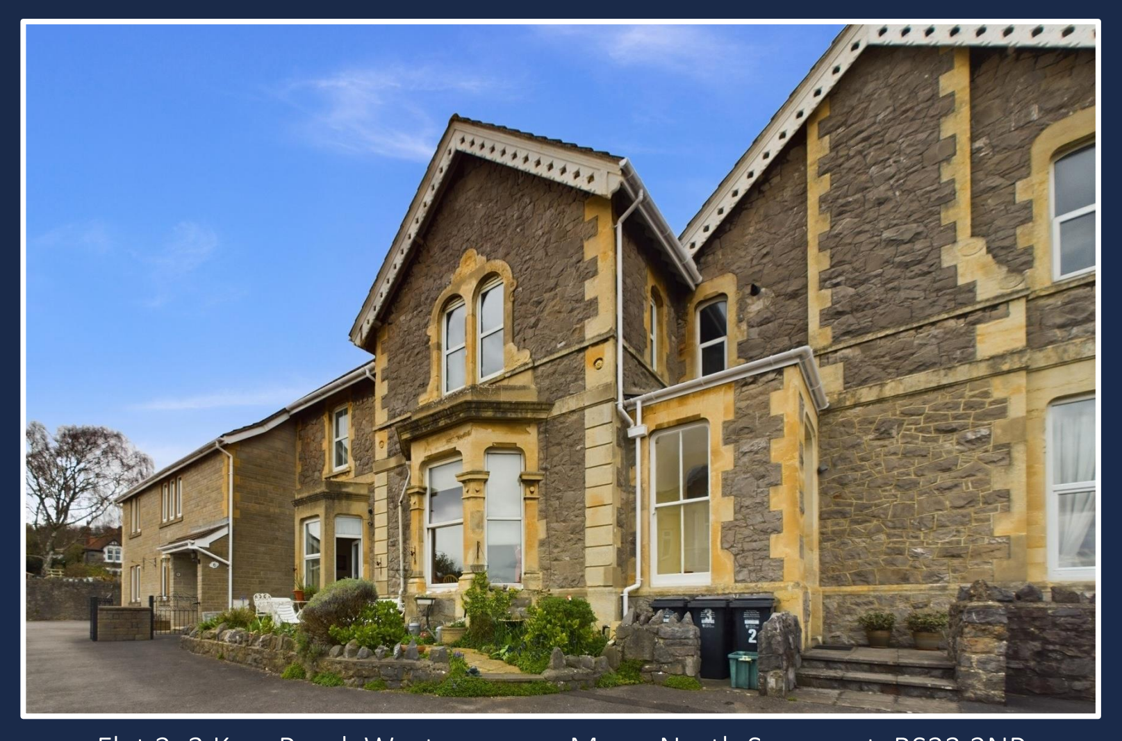
Flat 2, 3 Kew Road, Weston-super-Mare, North Somerset, BS23 2NP